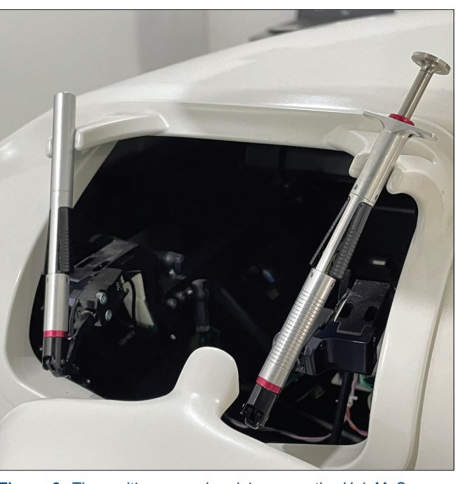
Figure 3: The multi-purpose handpieces on the HelpMeSee eye surgery simulator which are used to navigate the 'virtual instruments' in the eye on the simulator and provide real-time haptic feedback

The HMS Eye Surgery Simulator is a unique simulator that aims to train trainees in a procedure that has previously not been taught on a simulator with haptic feedback. To ensure that any new simulator provides a realistic comparison to real-life surgery, it must undergo scientific validation. This study aims to establish face and content of the HMS Eye Surgery Simulator in order to determine its value as a training tool. Authors regard that face validity is expressed as the assessment of virtual realism by novices, while content validity refers to experts' assessment of the suitability of a simulator as a teaching tool.<sup>[12,13,27]</sup> Given that the creation of the sclero-corneal tunnel is unique to MSICS, this representative task was chosen for assessment of face and content validity of the simulator. This tunnel when constructed well is self-sealing and therefore is very crucial with regard to the subsequent surgical steps and eventual outcome of the surgery. Therefore, in order to be proficient at SICS surgery, it is imperative that a trainee possesses the skill and the right technique to create and is clear of the corneal tunnel without any errors. There is a paucity of similar comparable data points for the HelpMeSee Eye Surgery Simulator.