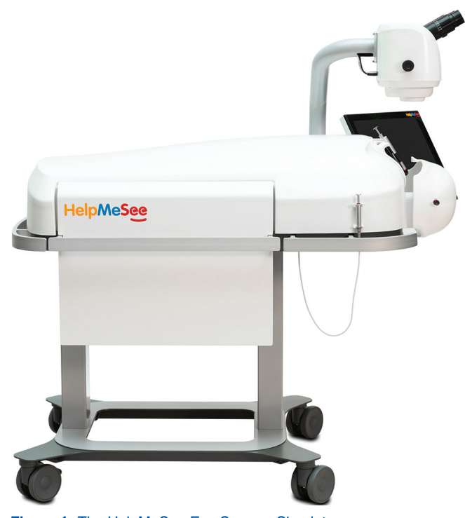
Figure 1: The HelpMeSee Eye Surgery Simulator

course comprises mainly of the scleral groove and tunnel dissection tasks, which were the assignments used to assess the face and content validity in this study.