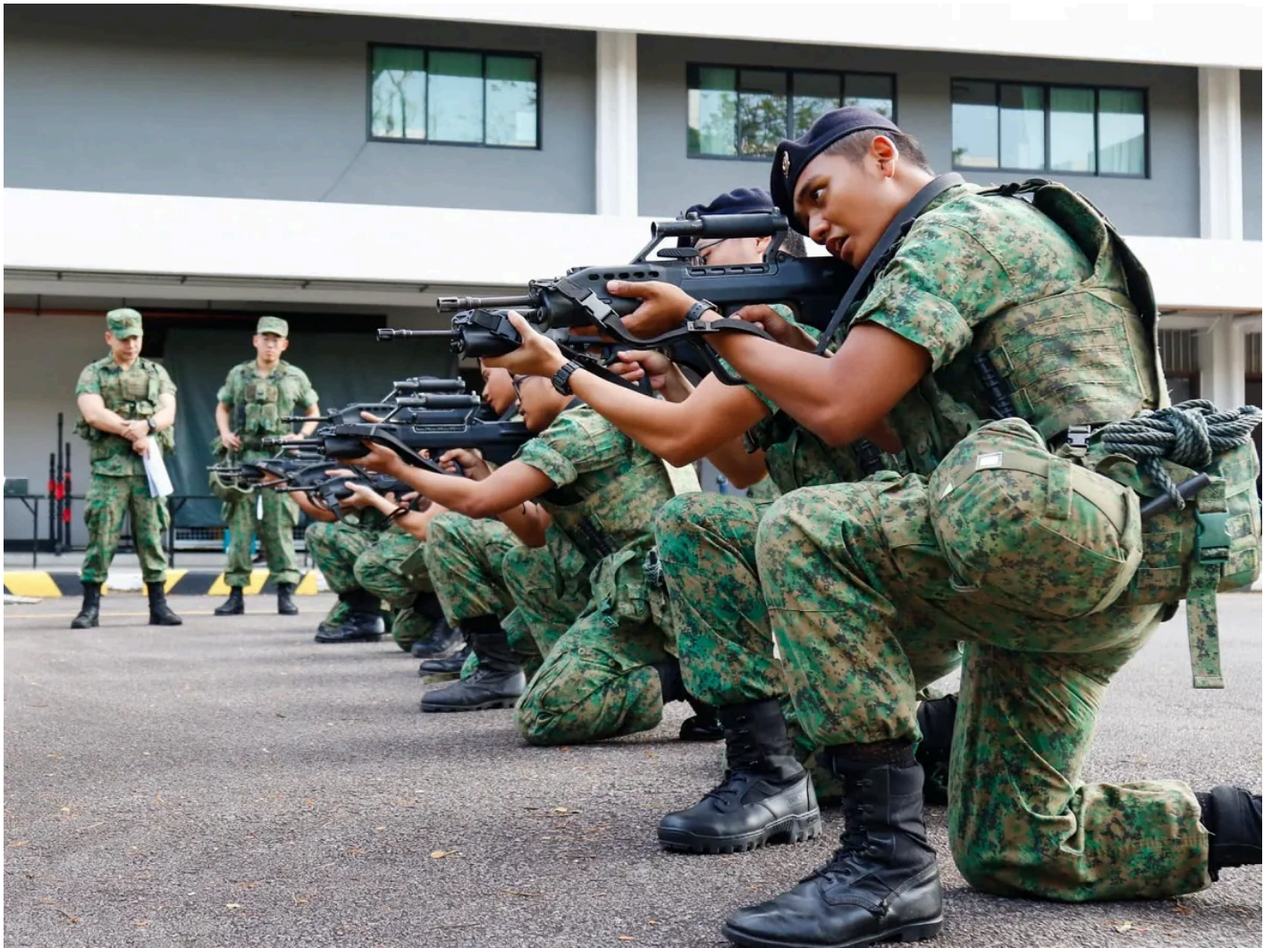
Singapore Armed Forces Enhancing Training Capacity