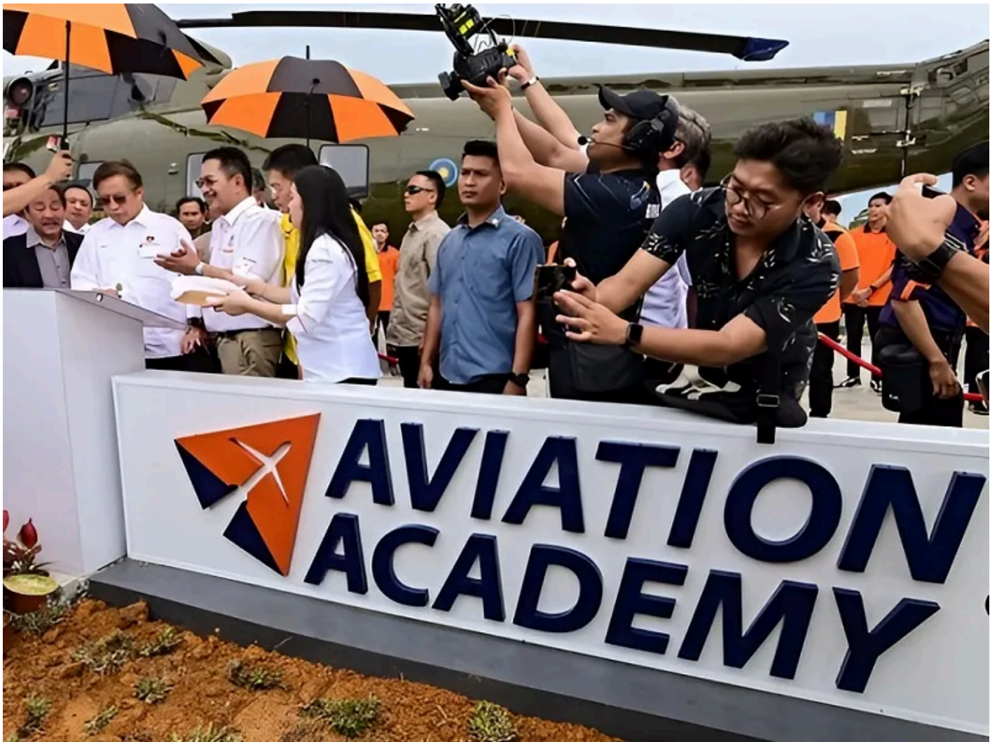
New Cabin Crew Training Course to Launch in Malaysia